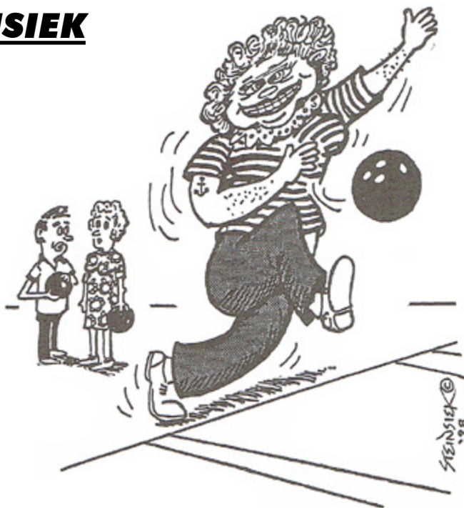
"MY MOTHER? I THOUGHT SHE WAS YOUR MOTHER!"