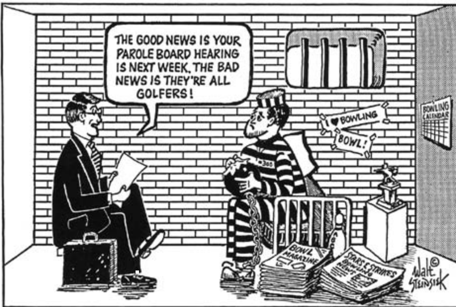
Walt Steinsiek's "Cartoon of the Week" is featured at ncausbca.org .